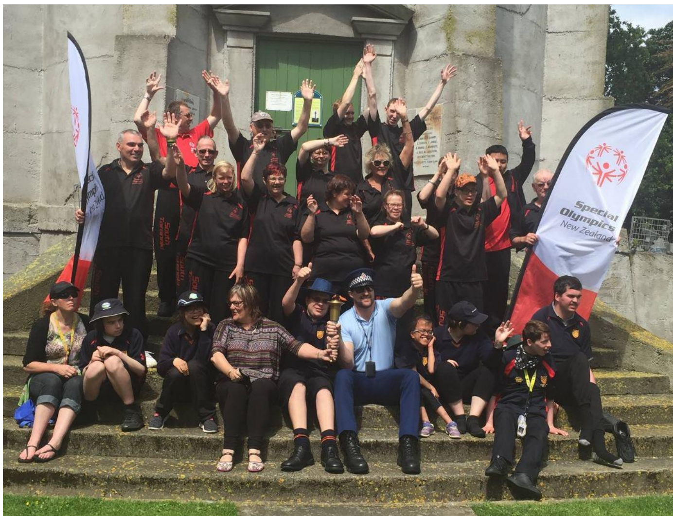
Endeavour Centre students celebrating Special Olympics

All staff support and encourage students to reach their personal potential and become valued members of society.