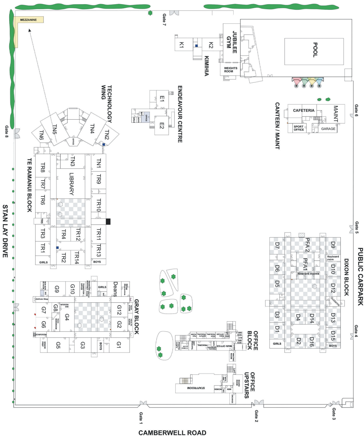
HAWERA HIGH SCHOOL PLAN

Our Student Voice: ‘There are lots of opportunities here. You experience things you never thought you would have the chance to try.’