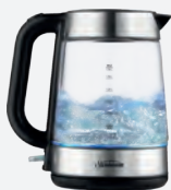
Sunbeam Capri Glass Kettle