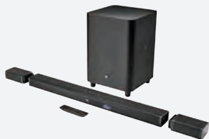
JBL Bar 5.1ch 4K Soundbar with Wireless Surround Speakers