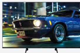
Panasonic 58" HX700 4K LED 2020 Television