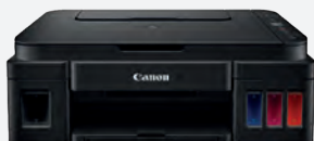
Canon Pixma Endurance G3610 Printer