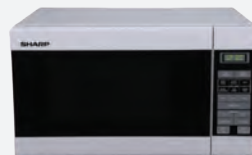
Sharp 20 Litre Microwave